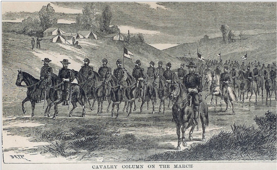
CAVALRY COLUMN ON THE MARCH

Confederate units are set-up according to the "At Start" section of the Order of Appearance card.