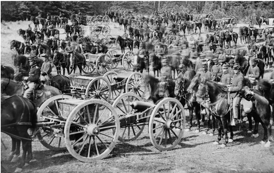
2 nd US Artillery, battery M

How they affected the game is based on the premise that they were important to Stuart, and not so much to Kilpatrick. As such, I simply gave the Confederate player points for what wagon counters he had at the end of the game, and the Union player's reward for eliminating any of them was keeping the CS player from getting those points.