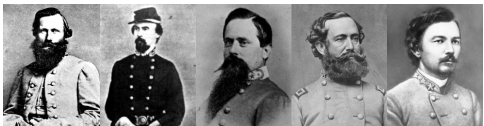
JEB Stuart John Chambliss Fitzhugh Lee Wade Hampton Robert Beckham Horse Artillery