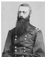
David M. Gregg