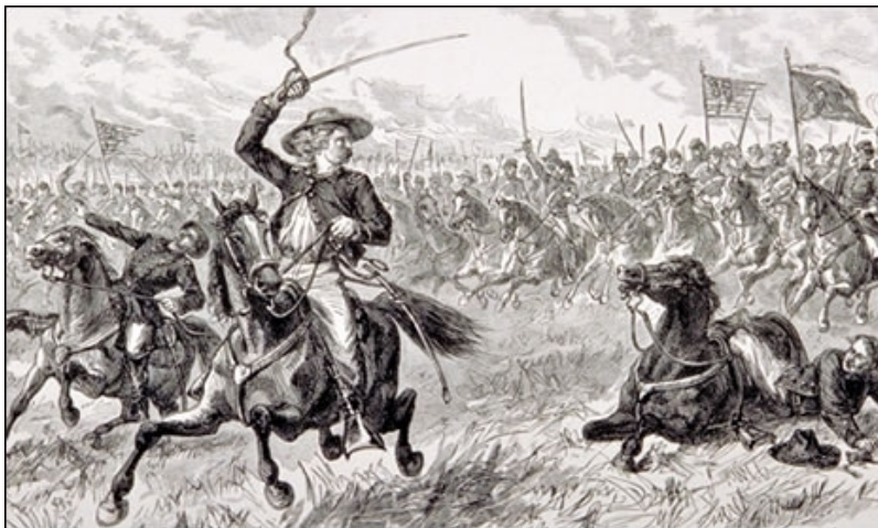
Custer joins a charge at Aldie